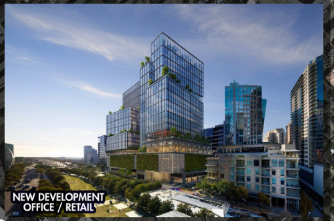
NEW DEVELOPMENT OFFICE / RETAIL